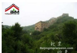
Gubeikou Great Wall