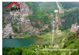
Simatai Great Wall