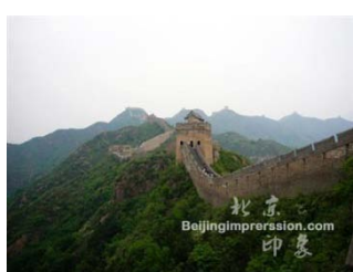
Jinshanling Great Wall