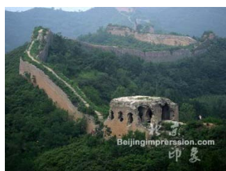
Gubeikou Great Wall